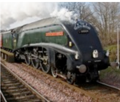
A veteran of the Waverley Route, LNER A4 Pacific Union of South Africa would be a popular choice of motive power.

Railway buffs from all over the country will want to travel down the Gala Water, and back, and one has only to see the numbers of people who travel every week into Carlisle, by steam and