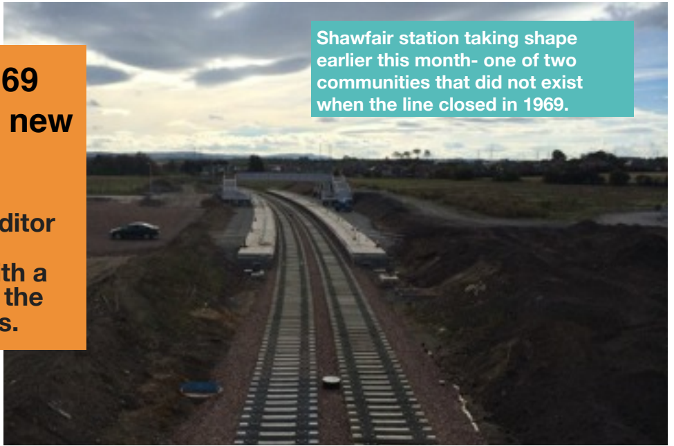
Shawfair station taking shape earlier this month- one of two communities that did not exist when the line closed in 1969.

diesel, over the Settle and Carlisle route to strengthen the demand for similar excursions on the Borders Railway.