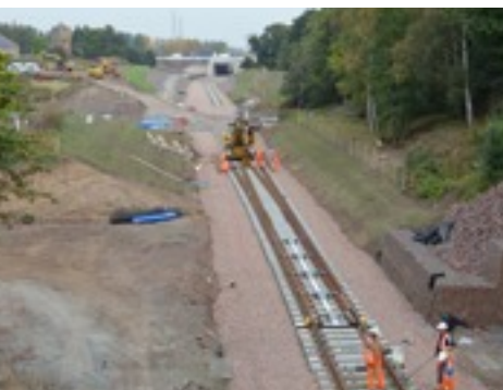
With the track laying train due on site shortly, preparations are underway up and down the line.

To stand or nominate, contact Chairman Simon Walton.