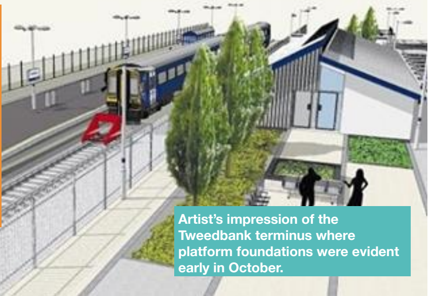
Artist's impression of the Tweedbank terminus where platform foundations were evident early in October.

When the original Waverley Route from Edinburgh to Galashiels, Hawick and Carlisle closed in 1969 it was all double track. The Borders Railway