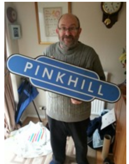
Auditions for "The Usual Suspects". Fails...